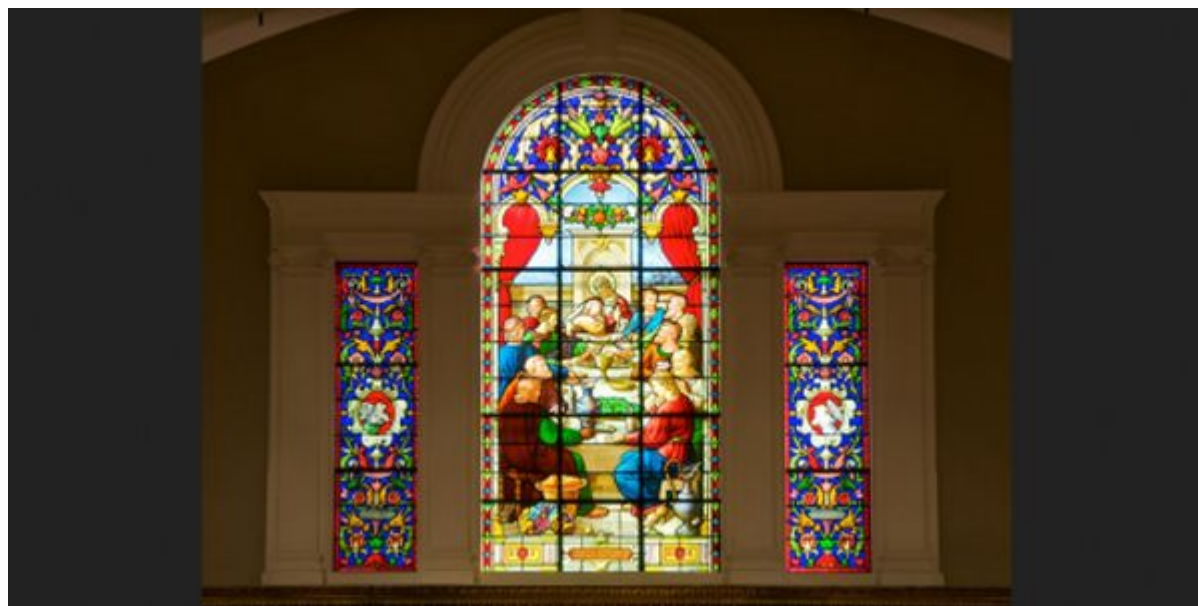
Stained glass windows, St. John's Episcopal Church, Washington D.C.

A church bishop can get in real trouble teaching certain Bible doctrines, it seems.