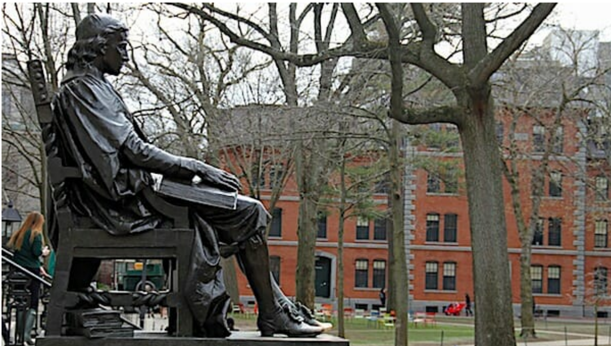
Harvard University

Following other prestigious institutions, Harvard Law School announced the launch of a religious freedom clinic, but already officials are refusing to defend it in response to criticism by LGBTQ activists.