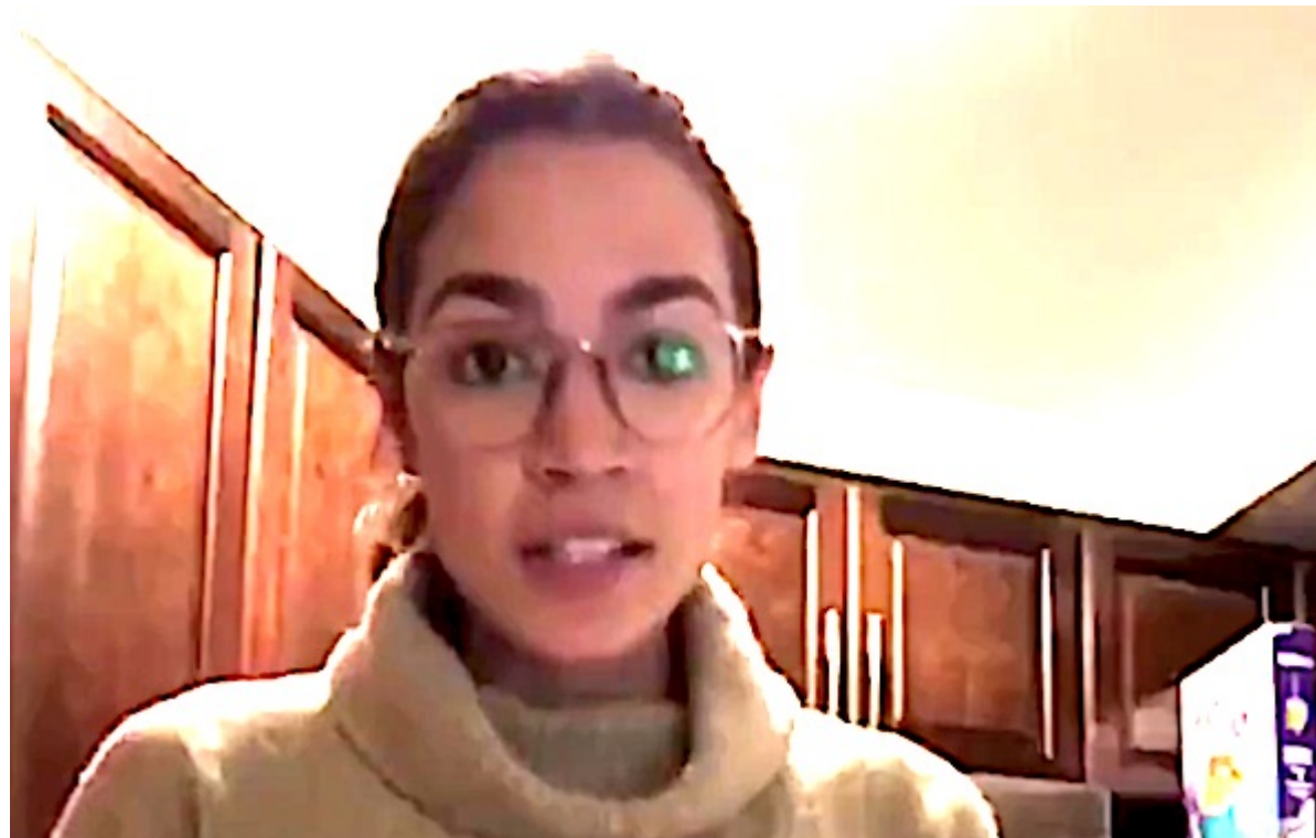
U.S. Rep. Alexandria Ocasio-Cortez, D-N.Y., posted an Instagram video from her kitchen