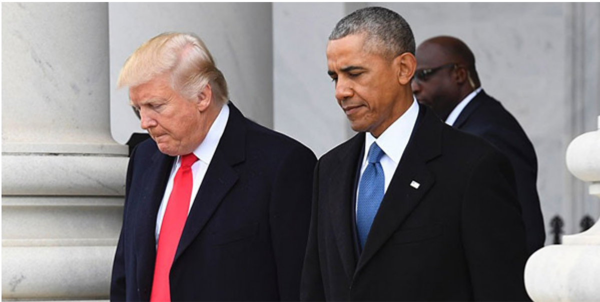
President Donald Trump with former President Barack Obama

It's abundantly clear now that the Obama administration tried to torpedo Donald Trump, first as a candidate and then as president-elect, using a Democratic Party-funded "dossier" of Russian propaganda to obtain warrants to spy on Trump's campaign.